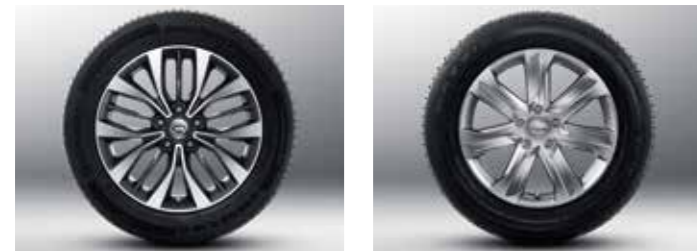
19" Aluminum Alloy Wheels 18" Aluminum Alloy Wheels