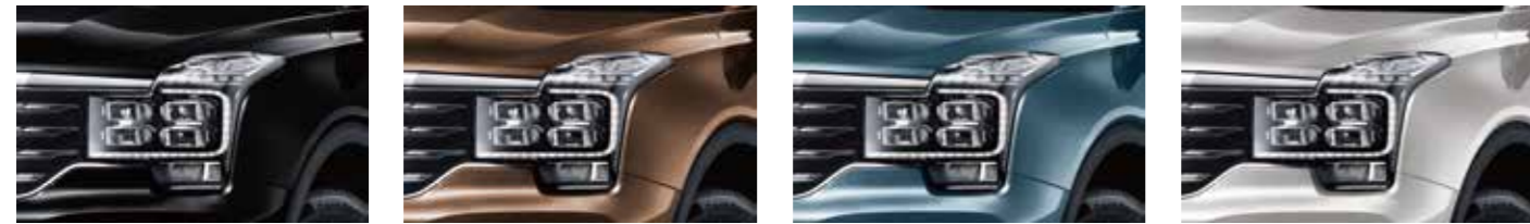
Elegant Black Coffee Brown Ice Blue Pearl White