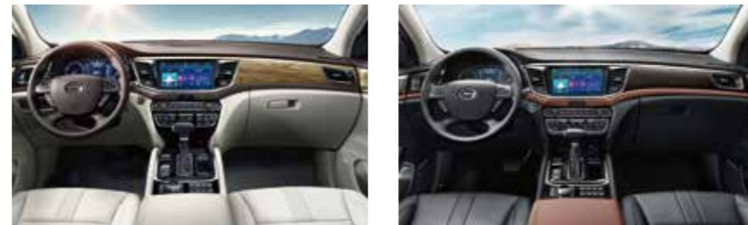
Light Interior Dark Interior